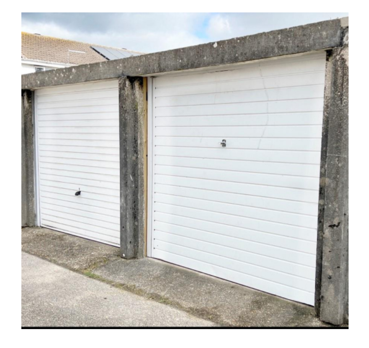
£17,500 Guide Price

Garage, Walton Road, Bournemouth Garages