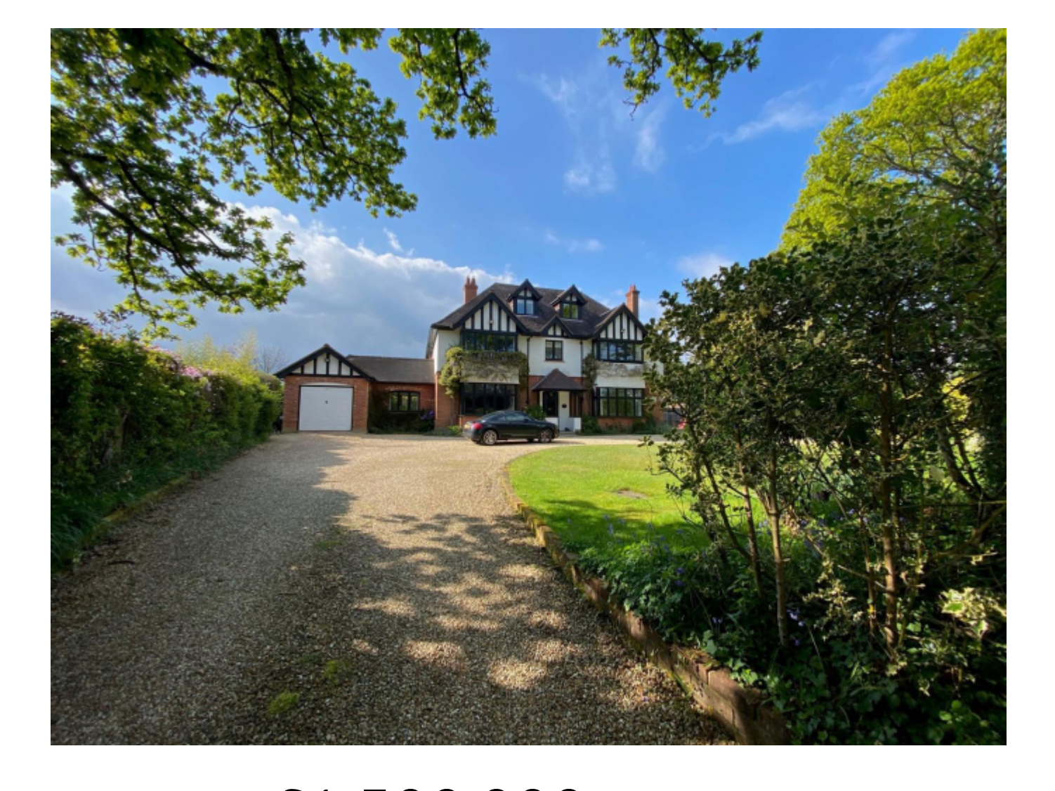
£1,500,000 Guide Price